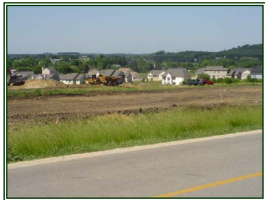
Table 2-2 of the Inventory and Trends Report within the Comprehensive Plan (p.2- 4) shows housing unit growth from 1990 to 2000 by municipal type. As indicated by Table 2-2, cities in Dodge County experienced the greatest increase in housing units from 1990 to 2000. According to Table 2-1 of the Inventory and Trends Report within the Comprehensive Plan, the City of Watertown had the greatest increase with 710 units, or a 28.9% increase. Other than the Cities of Columbus and Hartford, which are only partially located in the county, all cities had a housing unit increase of at least 100 units.

Also, Table 2-1 indicates that the villages in Dodge County increased their total number of housing units by 952, or 31.4%. Two villages, Neosho and Kekoskee, experienced a minimal housing unit decline from 1990 to 2000. The remaining villages experienced housing unit growth of 11% or greater. The Village of Lomira had the greatest overall increase in units with 336, followed by the Village of Theresa with 237 units.